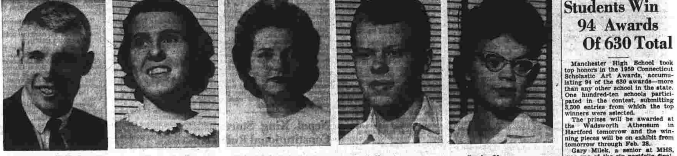
Students and faculty members at the art contest awards ceremony.